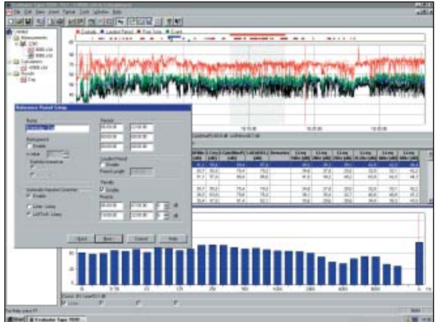
Fig. 1 The Evaluator screen provides you with the tools for visually combining measurement data to produce contributions for calculating a Rating Level

In a practical approach to measuring environmental and community noise (Rating Levels), a four-step process is normally used: