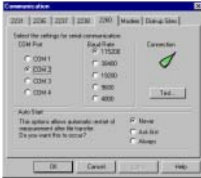
Fig. 2 Tab pages in Evaluator

Data can be downloaded into Evaluator either via a PC-card or via an RS-232 serial link. Data files are stored in Evaluator projects, which are groupings of files containing all raw data, calculations, and results for a particular set of measurements.