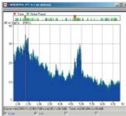
Fig. 3 An FFT spectrum with the cursor at a pure tone of 2343.8 Hz

To help you visualise your measured data graphically, Evaluator can present measured parameters in the following ways: as a noise profile display (level versus time), as a spectrum display of 1/1-octave and 1/3-octave filters, as an FFT spectra (level versus frequency), or as a statistical display of cumulative or level distributions (percentage versus level).