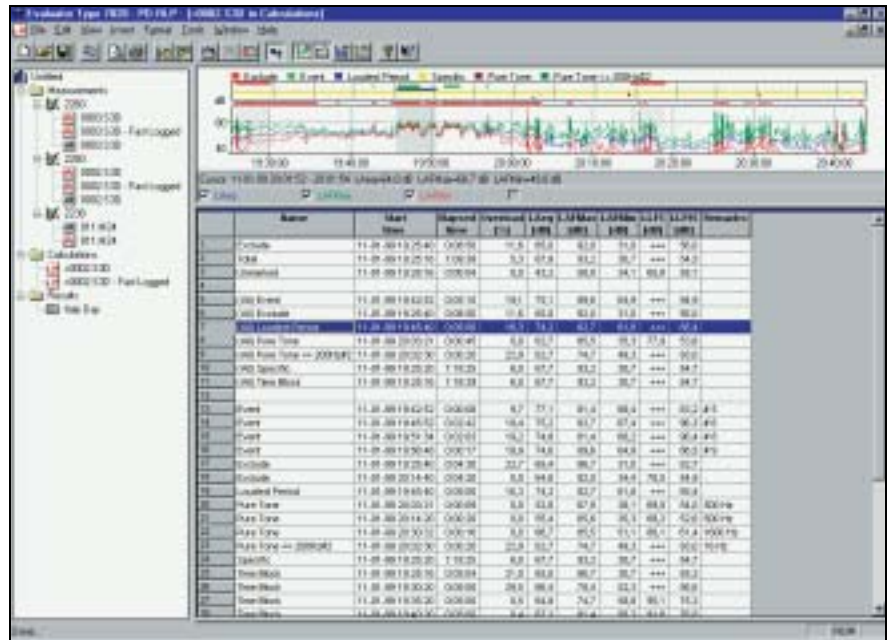
Fig. 7 Table of Markers in the Calculations program, in alphabetical order, highlighting the Loudest Period in both the table and the graphic

In some Brüel & Kjær Sound Level Meters, markers can be set during the measurement to identify measurement events, objects or conditions. Marker information is transferred with the data into Evaluatör, for display.